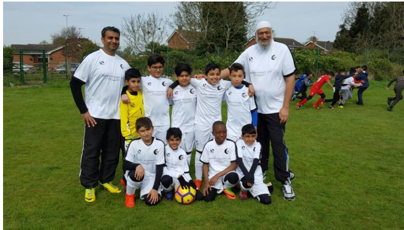
2017 Khidmah Tournament